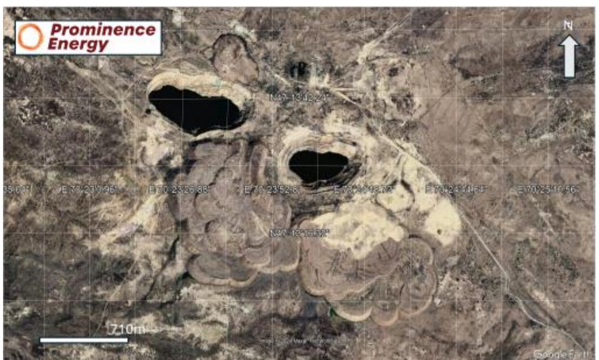
Figure 4 - Google Earth image of Djideli site showing the material on site to be remediated

This project is considered to be commercial and socially responsible, and the Djideli pilot plant will result in the decontamination of a former mine site, whilst producing uranium, that will be used in the generation of carbon-free nuclear electricity.