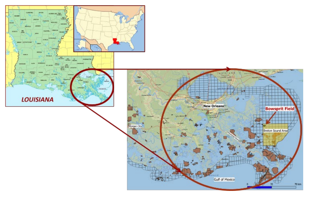
Figure 1 - Bowsprit Project Location Map (PRM 100% working Interest).

PRM is currently finalising the well design, completion design and costing for a side track of the Bowsprit 1 well to target the T1 reservoir and proven reserves, most likely in Q1 2023 following the northern hemisphere winter season.