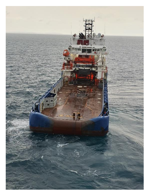
GO Spica support vessel preparing to tow the Valaris MS-1 rig to the Sasanof-1 exploration well location