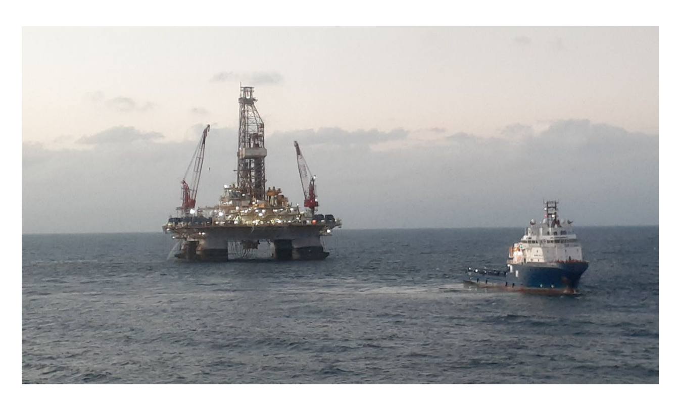
Valaris MS1 rig under tow to the Sasanof-1 exploration well location

Email: <u>admin@prominenceenergy.com.au</u>