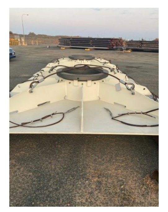
Mud Mats for Conductor Support