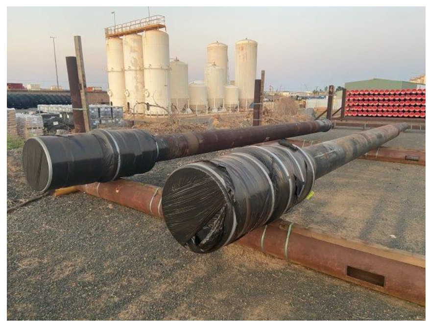
High Pressure Wellhead Housings (HPWHH)